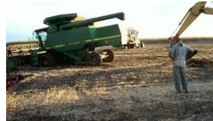
"I was sure I could make one more round."

After the 5-day Thanksgiving holiday (at least for the school kids) I hope you had a welcome break before the hustle and bustle of the weeks leading up to Christmas. Sadly, the weather is kind of 'up-in-the air' as to what we will have and where we will have it. Hopefully, we all stay safe!